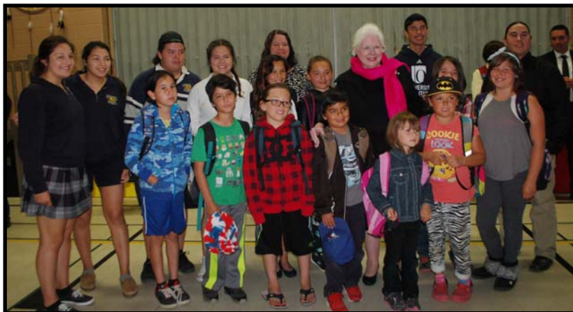
NPSC Native Language students meeting Her Honour Elizabeth Dowdeswell, 29th Lieutenant-Governor of Ontario.

On Wednesday, May 4, students from schools across NPSC gathered in the SJSH Chapel for the NPSC Elementary Student Forum, which was themed “Opening Doors of Mercy”. Thirty-one elementary students in Grade 6, 7 and 8 attended, representing each of the eleven NPSC elementary schools. The Forum was coordinated by the Student Trustee and nine of her peers, who taught valuable leadership, communication and confidence skills, to help empower elementary students to become active learners and leaders in their respective schools. All attendees were given an opportunity to select topics that were of interest and relevant to their own education. The afternoon portion of the Forum consisted of a presentation from Grade 9 students about the transition from elementary to secondary school. Students were also given the opportunity to ask facilitators any questions they had.