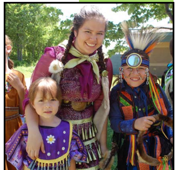
Grade 6 retreat at Nbisiing Secondary School.